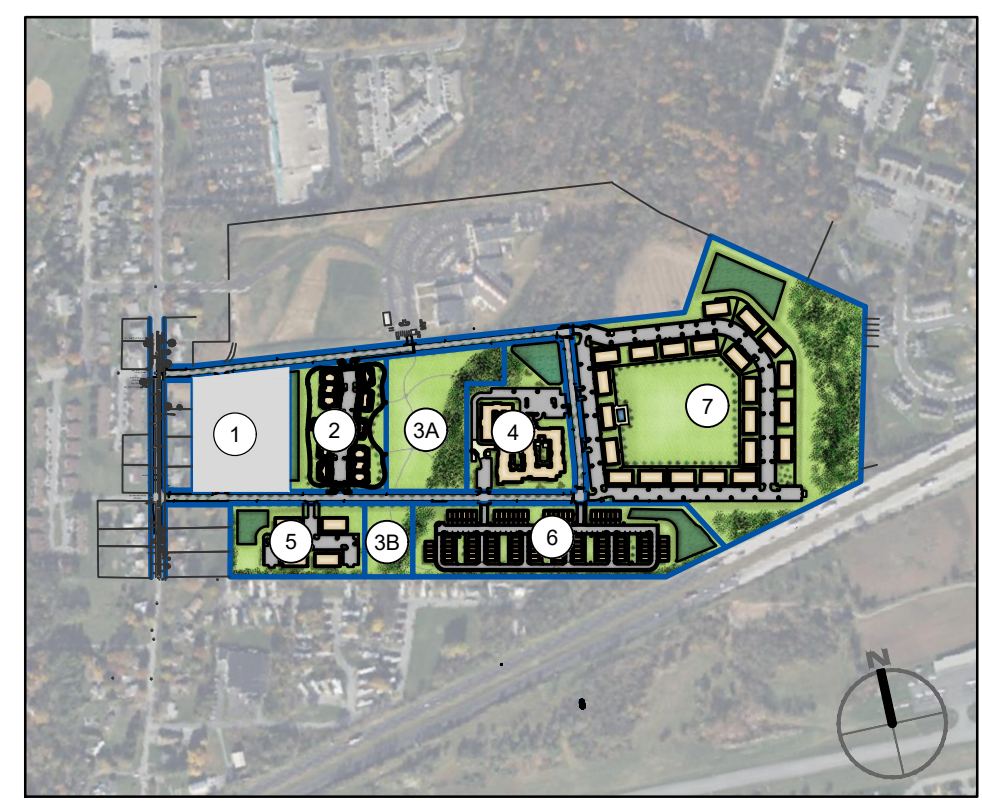
KEY MAP 800' 400' 0' 800' SCALE: 1"= 800'