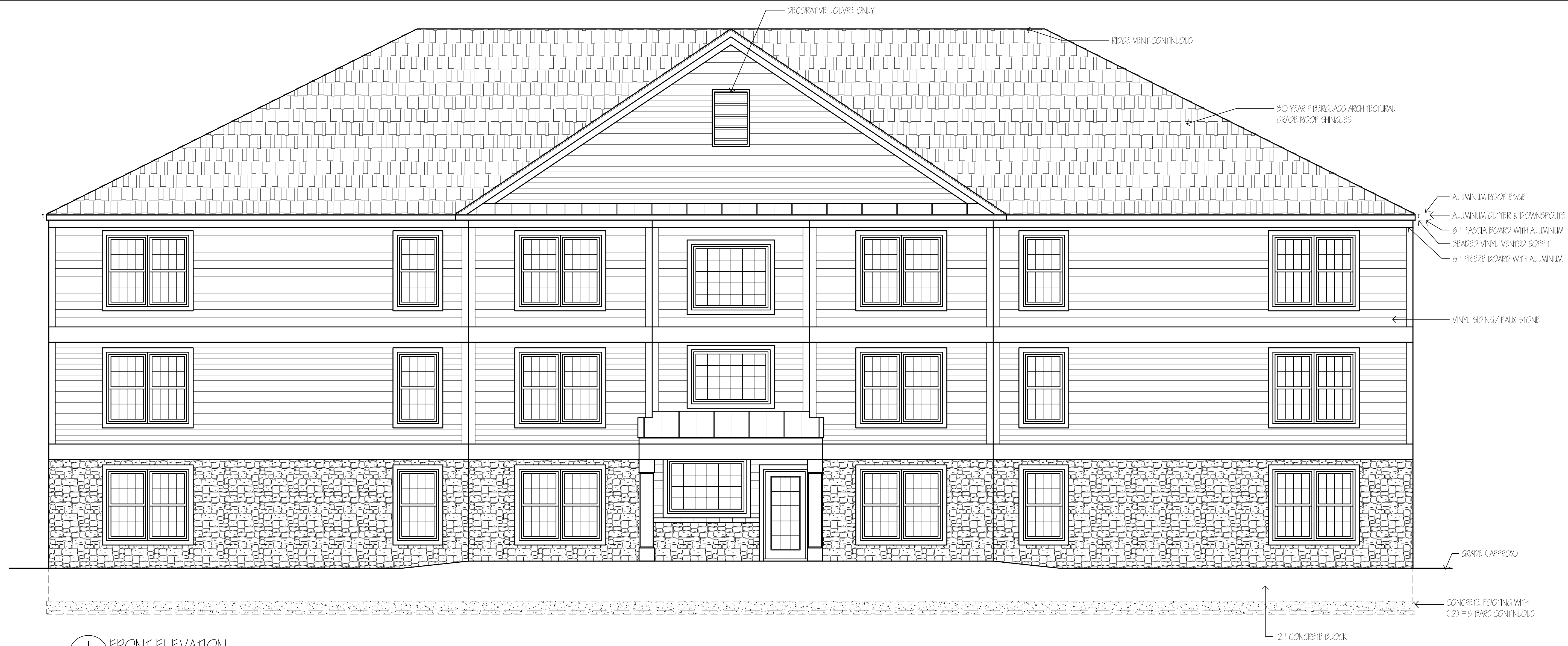
1 FRONT ELEVATION A-5 SCALE: 1/4" = 1' - 0"